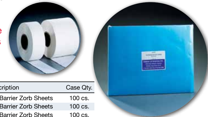
Custom Size Zorb Sheets

Tissue based papers impregnated with super absorbent polymers with an added poly-coated backing for protection against fluid penetration.